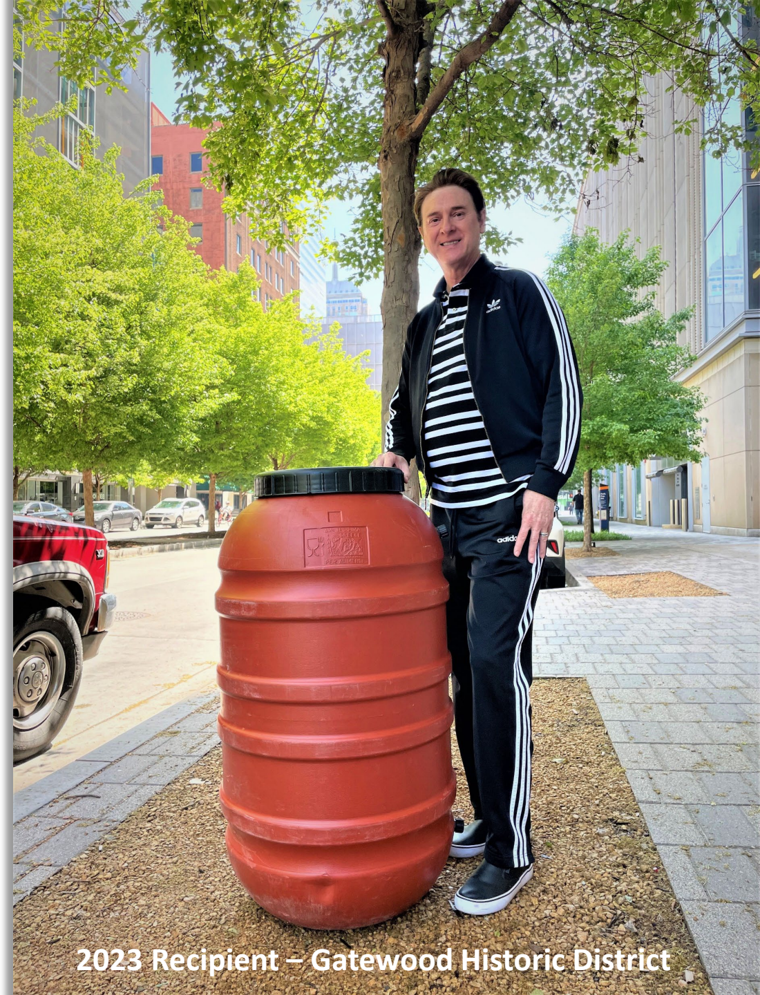
2023 Recipient – Gatewood Historic District