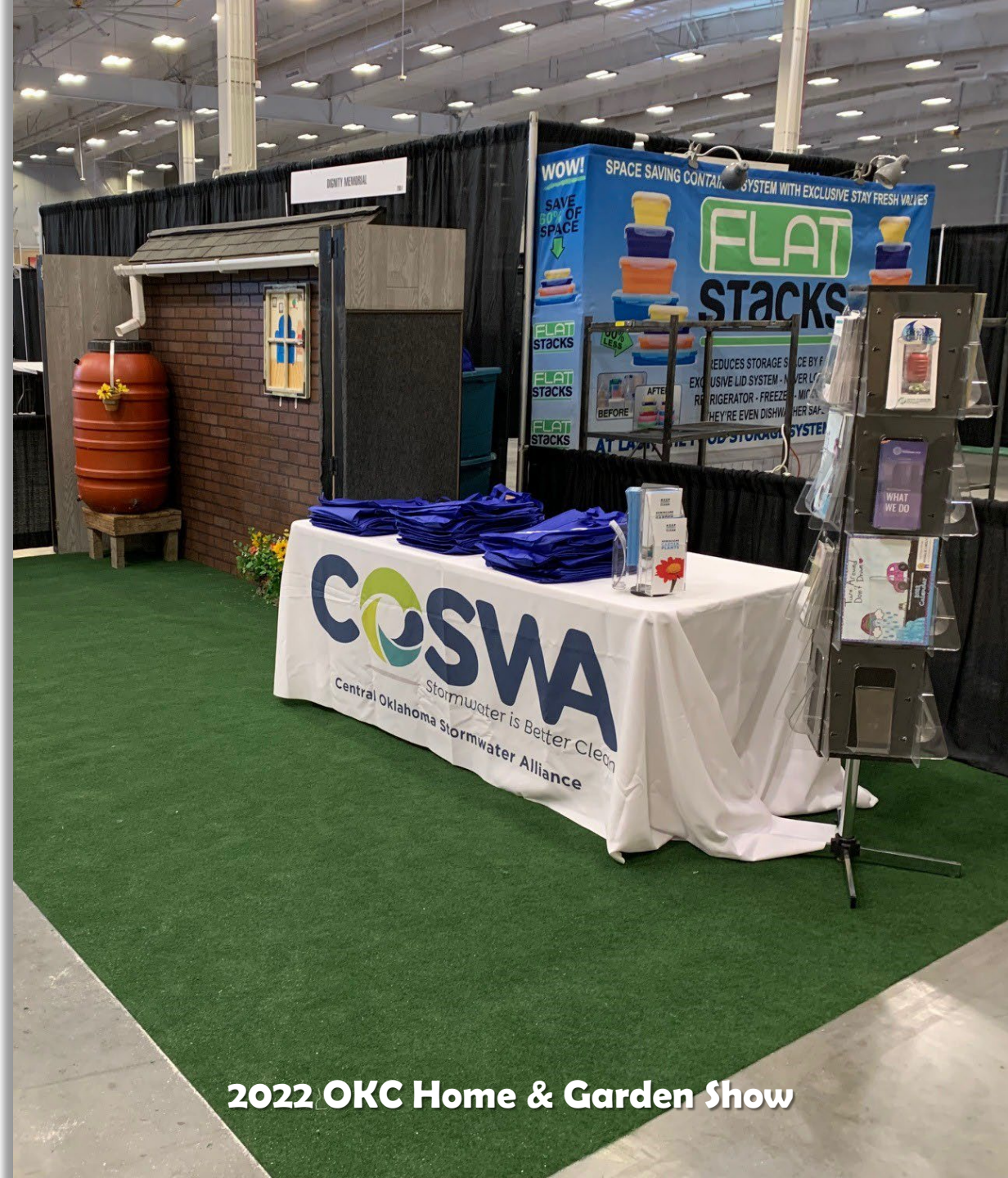
2022 OKC Home & Garden Show