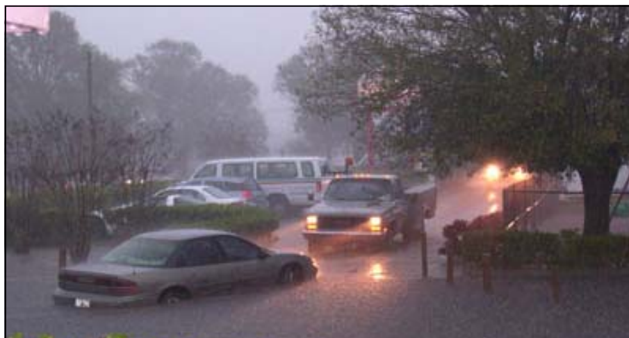
Floodplain Act Blocks Program Participation