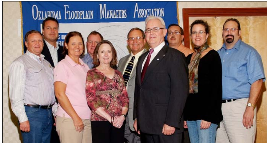
18th Annual Fall Conference Wrap-Up