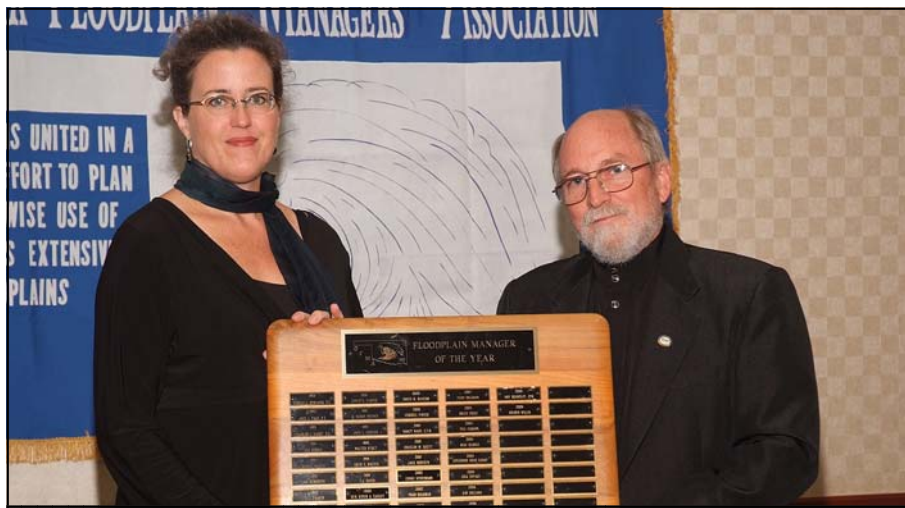
18th Annual OFM Awards