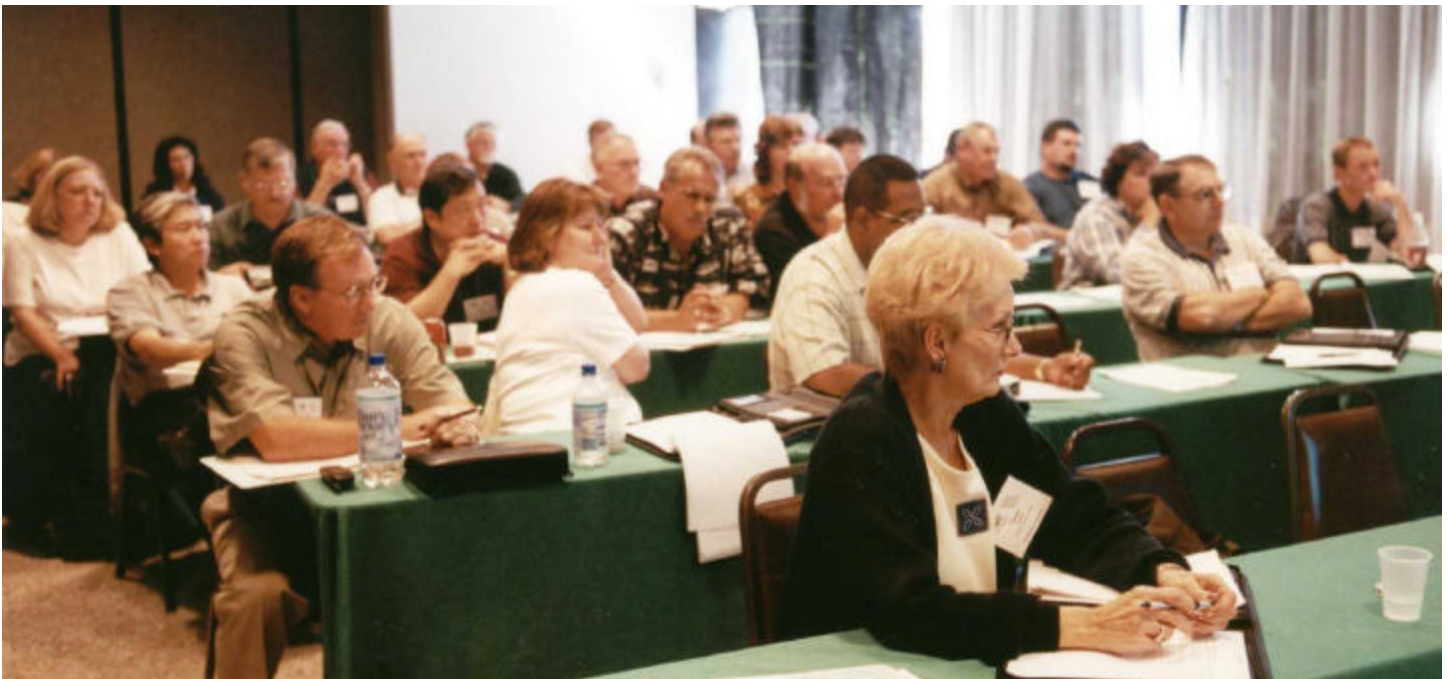
OFMA members listen intently during a plenary session of OFMA's Fall 2000 Conference at Lake Texoma Resort.

The 10 th Annual Fall Conference of the Oklahoma Floodplain Managers Association, held Sept. 25-28, at beautiful Lake Texoma Resort, was attended by 108 floodplain managers, one from as far away as Hawaii.