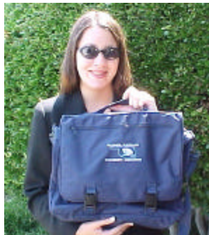
OFMA Briefcase $25 (Model: Priceless)

Oklahoma Floodplain Managers Association gifts are now available. The attractive OFMA articles are of the highest quality. You will be proud to wear and display them.