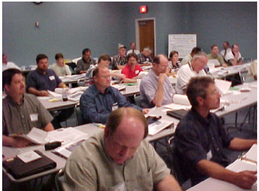
Oklahoma Floodplain Managers attend one of five workshops held throughout the state.