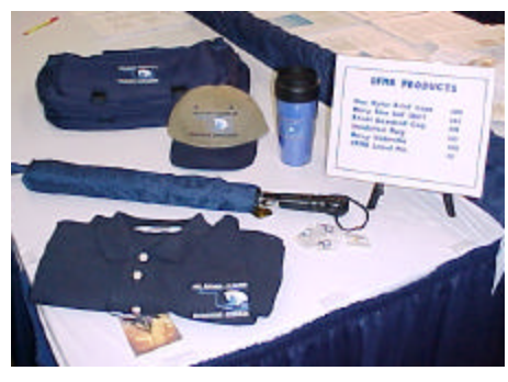
OFMA Products - Top to Bottom: Briefcase, Baseball Cap, Insulated Mug, Umbrella, Pins, Golf Shirt.

OFMA Shirt $ 35.00 Sizes (S, M, L, X-L) Briefcase 25.00 Baseball Cap 15.00 Size (One size fits all) Insulated Mug 10.00 Umbrella 20.00 Portfolio 25.00 Lapel Pin $ 3.00