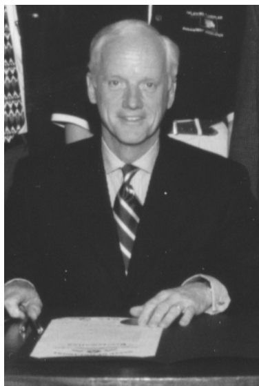
Governor Frank Keating

The Flood Awareness Month Proclamation for May 2001, reminds Oklahomans that flooding causes more than $2 billion in property damages annually.